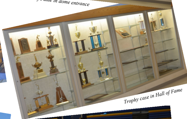
Trophy case in Hall of Fame