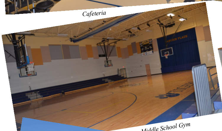
Middle School Gym