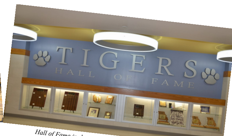
Hall of Fame in dome entrance